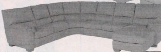
Sage Microfiber 4-Piece Sectional $1611 w/Chaise