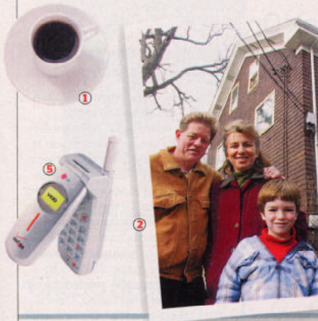
ILLUSTRATION BY CHRISTOPH HITZ

before she starts the egg-producing process all over again