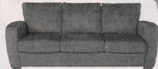
Claret Microfiber 3-Piece Set $1451 (Sofa, Loveseat & Chair) Ottoman $182