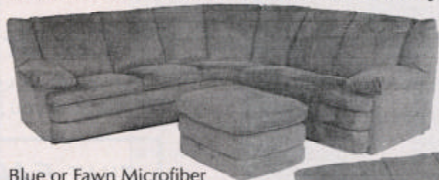
Blue or Fawn Microfiber 3-Piece Sectional $1411 Ottoman $224