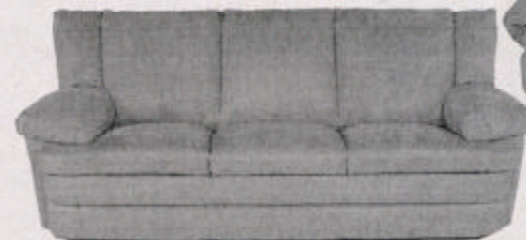
Fawn or Blue Microfiber 3-Piece Set $1917 (Sofa, Loveseat & Chair) Ottoman $224